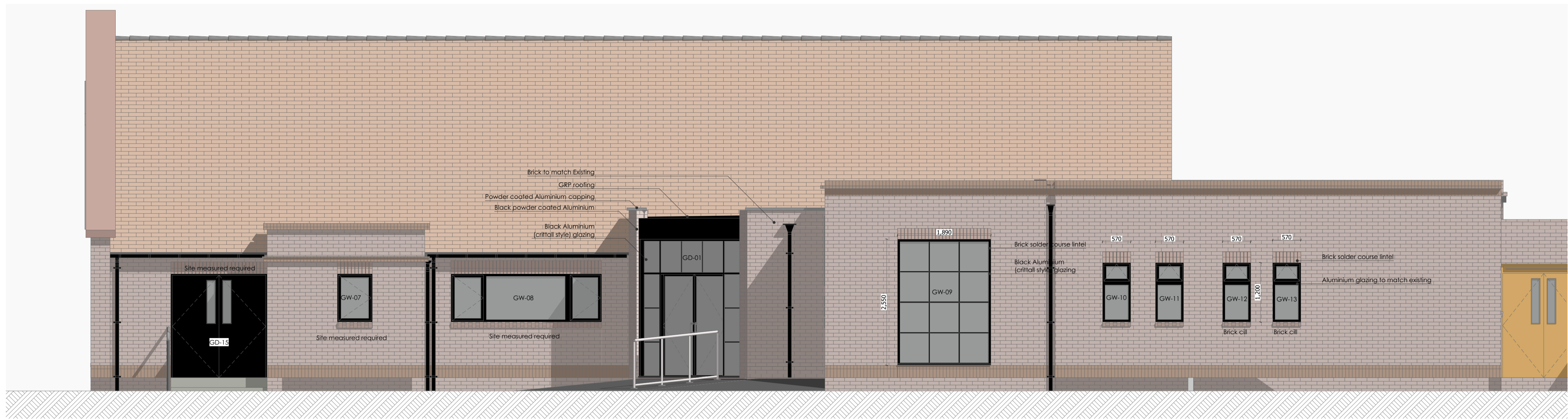
E-01 Elevation 1:50

NOTE: 1. All dimensions/descriptions are to be checked. Discrepancies are to be reported immediately. 2. NO dimensions to be scaled off this drawing. 3. ANY changes in materials must be approved by the architect, building control and planning if applicable prior to order. 4. All drawings to be read in conjunction with structural drawings.